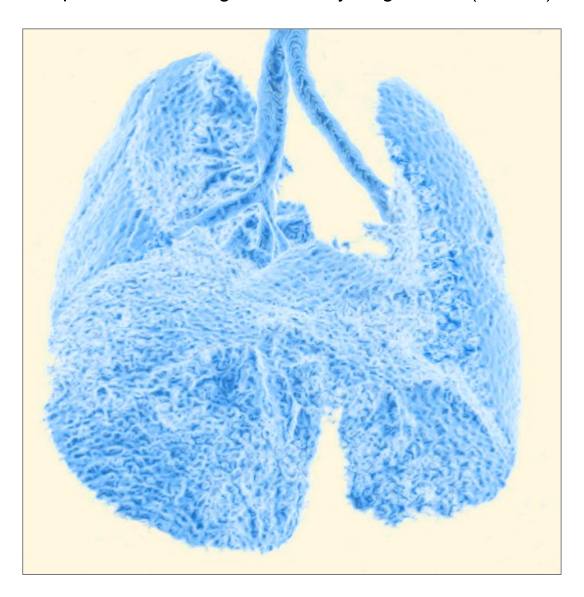
Pkm1: potential new target for deadly lung cancer (IMAGE)